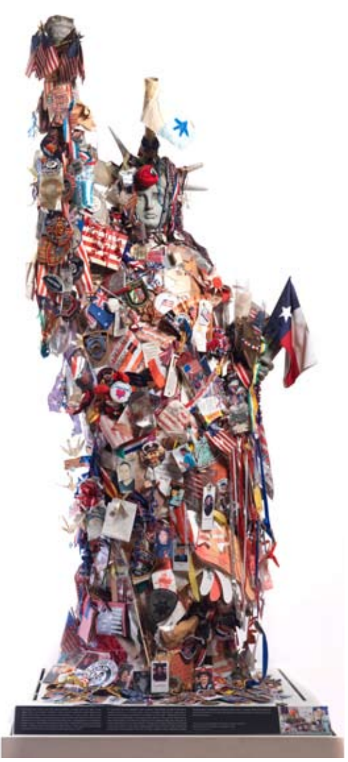
Gift in memory of the courageous firefighters from Engine54/Ladder 4/Battalion 9 killed at the World Trade Center on September 11, 2001.