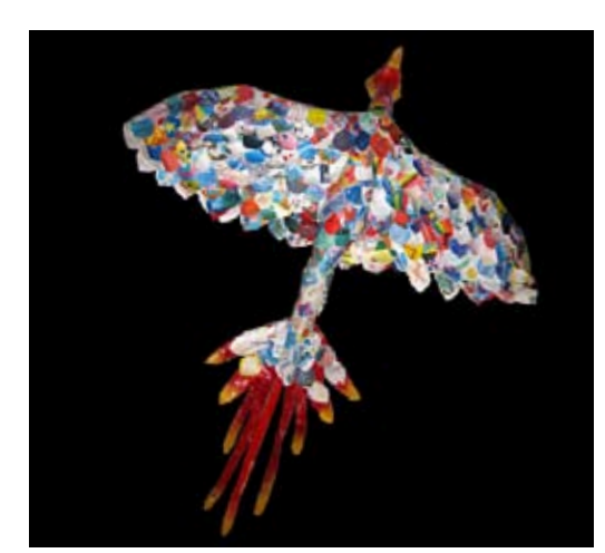
Feathers of the Phoenix.