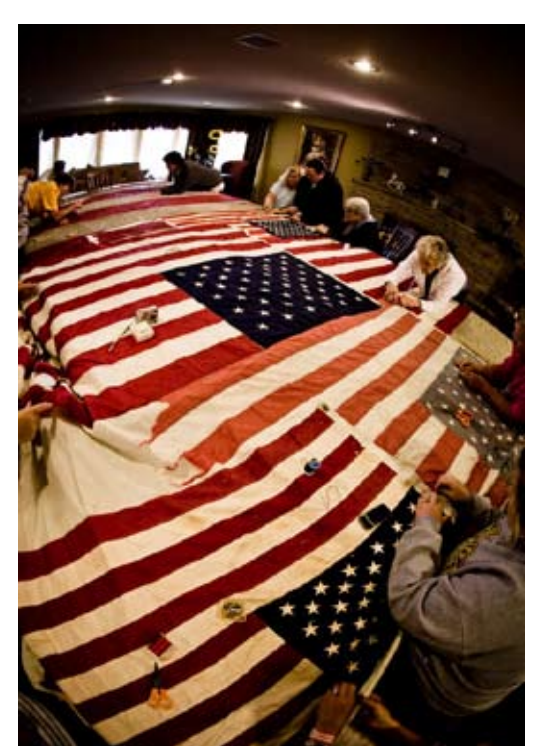
Promised gift to the 9/11 Memorial Museum.