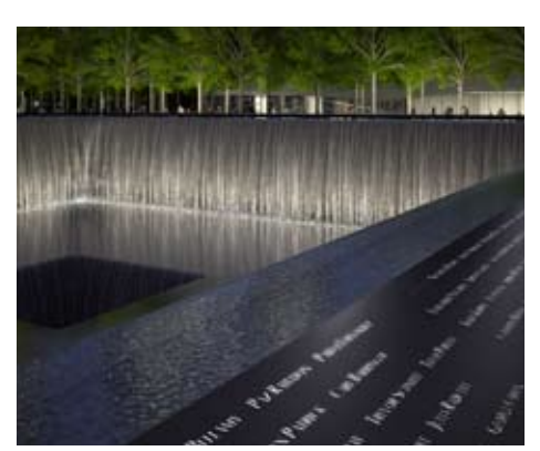
The Memorial names parapet at night. Rendering Squared Design Lab