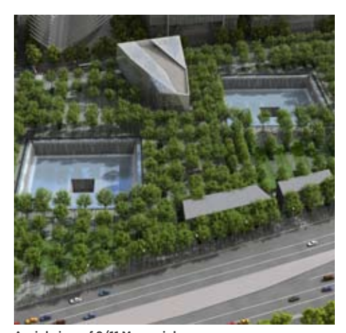
Aerial view of 9/11 Memorial. Rendering Squared Design Lab